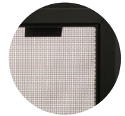
SAFETY SCREEN BARRIER